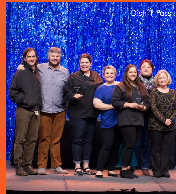
Dish 'T Pass